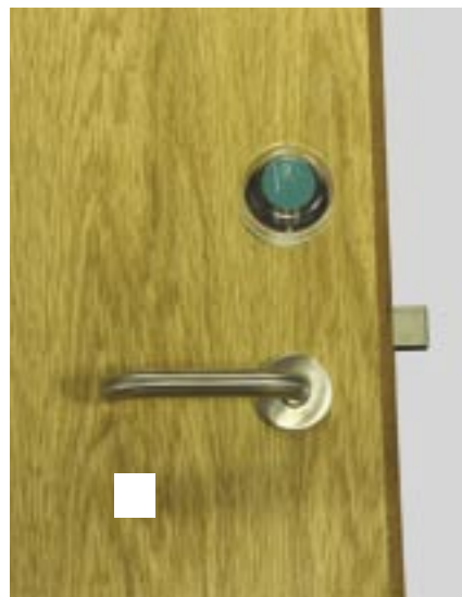
Note: Images show thumbturn options, with and without break dome.